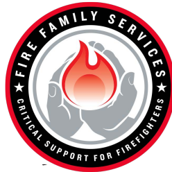
Fire Family Services