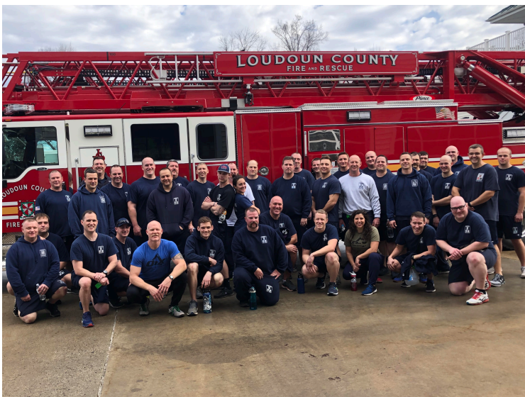
Loudoun County Fire-Rescue Department

I am honored to be a part of the incredible work O2X is doing around the country and am proud to represent them. O2X means Optimizing to the Target(X), and our aim is to help maximize our students' performance so that they can achieve their goals, both on and off duty.