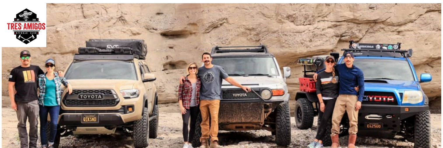
The Tres Amigos they travel with purpose!

We're very excited about the next few years, so stayed tuned as we do our part to help FirefighterAid become the best it can be nationwide!