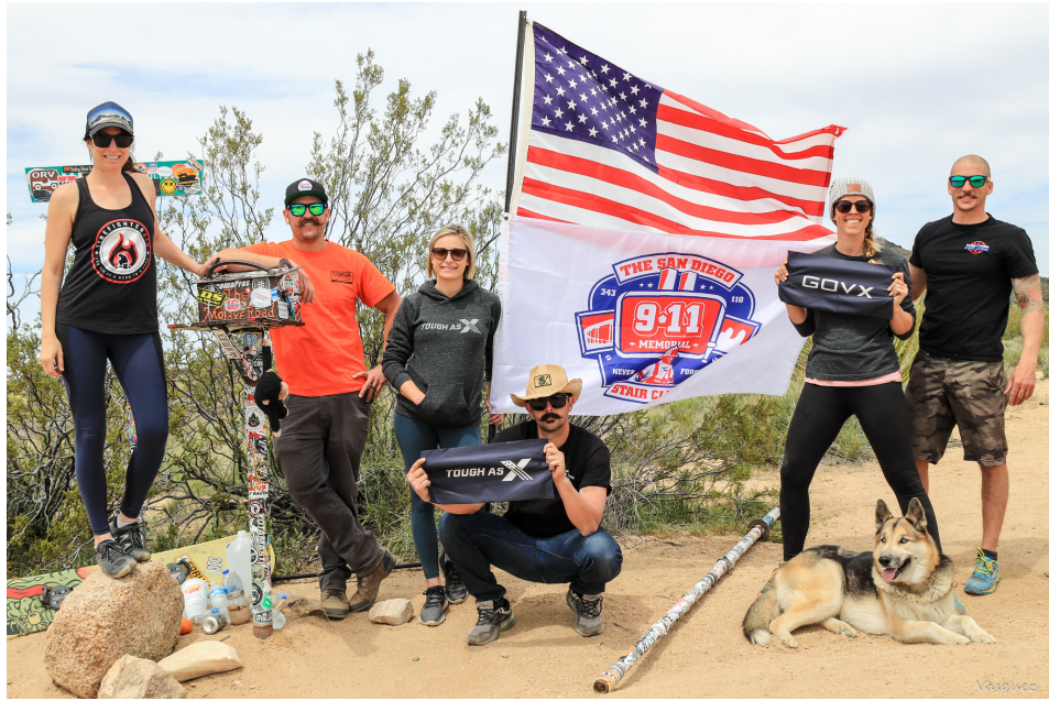
The Tres Amigos