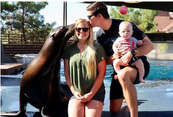
Wildlife World Zoo, Arizona

I'm extremely thankful, humbled, and honored to be where I'm at today and that's due to my fellow firefighters and my family. I look forward to the rest of my career in serving the community that my family calls home.