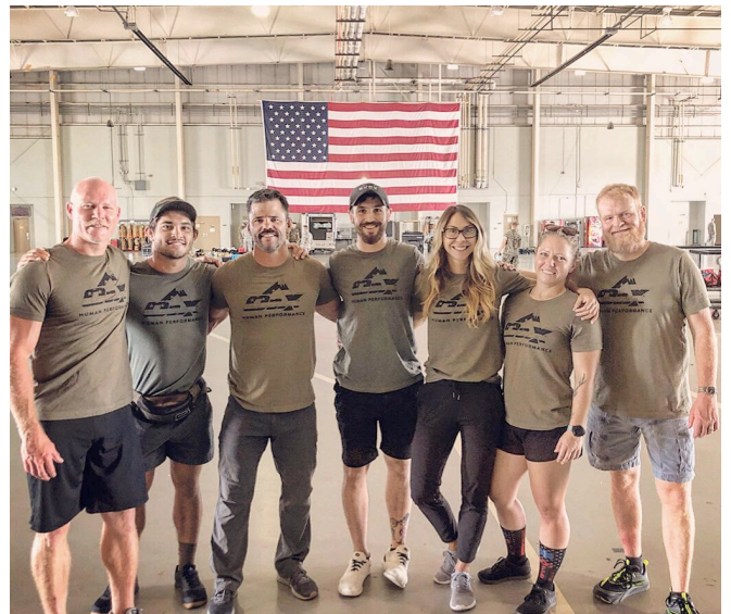
The amazing O2X Team