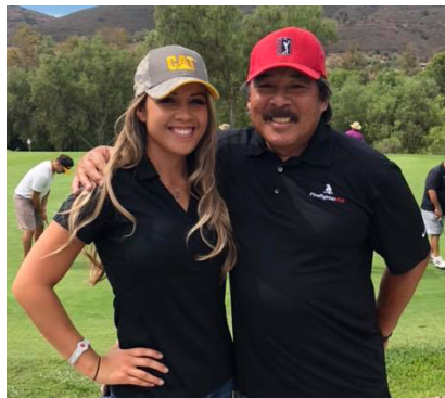
The 2018 ACI Golf Tournament