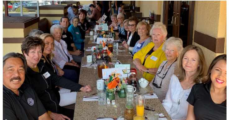
SDFRA and FFAID Staff along with our lovely ladies

Our mission is to honor the noble traditions of a firefighter for caring for them and those they leave behind. Our organization was established in 1907 and set the foundation for taking care of our own and their families. When we reached out, connected, and reunited with these amazing ladies who also gave vast pieces of their lives to the same family, we had no idea the effect that it would have on these ladies and our organization.