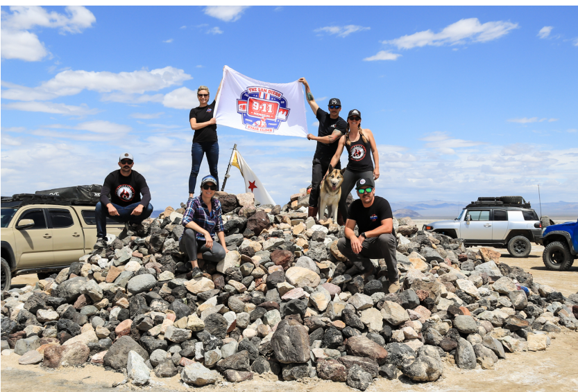
The Tres Amigo crew at Mailbox, CA in April 2019

Over the years, we've become close to the people who organize the climb and manage FirefighterAid. The people behind the scenes started as friendly faces whenever we stopped by the office to drop off donations. Since then, we've seen that they are a deeply committed team passionate about helping our first responders locally and nationally. We've seen their passion tested with cancer, injuries, deaths, and more. They are all there during the difficult moments, ready to lend a hand any way they can. Seeing the dedication of the FirefighterAid crew is what keeps us coming back to fundraise because we know the money we raise is going to good use.