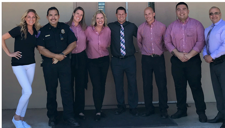
FFAid, Donnavan's & Chick-fil-A Team

Sending you the upmost gratitude and wishing you and your loved ones peace, health, happiness, and prosperity in the coming New Year!