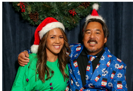
Spreading holiday cheer in 2019

This is just a glimpse at what is to come in 2020! There are a lot of exciting improvements that our Board of Directors and Staff are implementing in 2020. One of the items will be SDFRA reimbursements. Many of the claim receipts we receive today are missing information needed to reimburse you and your families. In some cases, we have to contact you to get that information which also causes delays. We're asking for your help so we can better serve you!