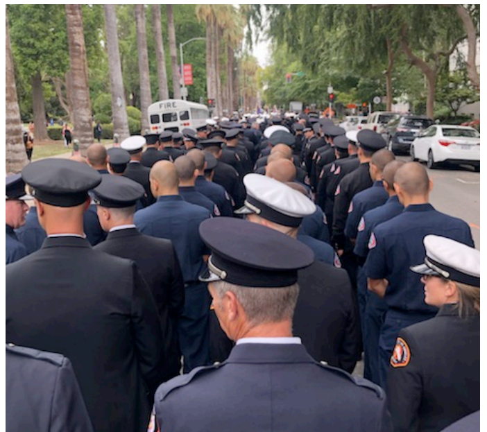
California Firefighters Memorial Capitol Park, Sacramento, CA